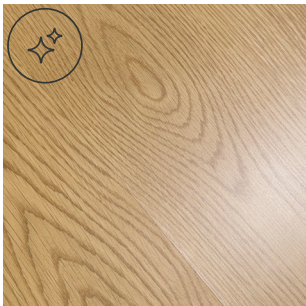
Matt Lac 15-20% gloss, No Brush