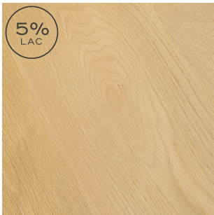
Extra Matt Lac 5% gloss