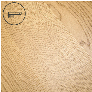
Matt Lac 15-20% gloss, Brush